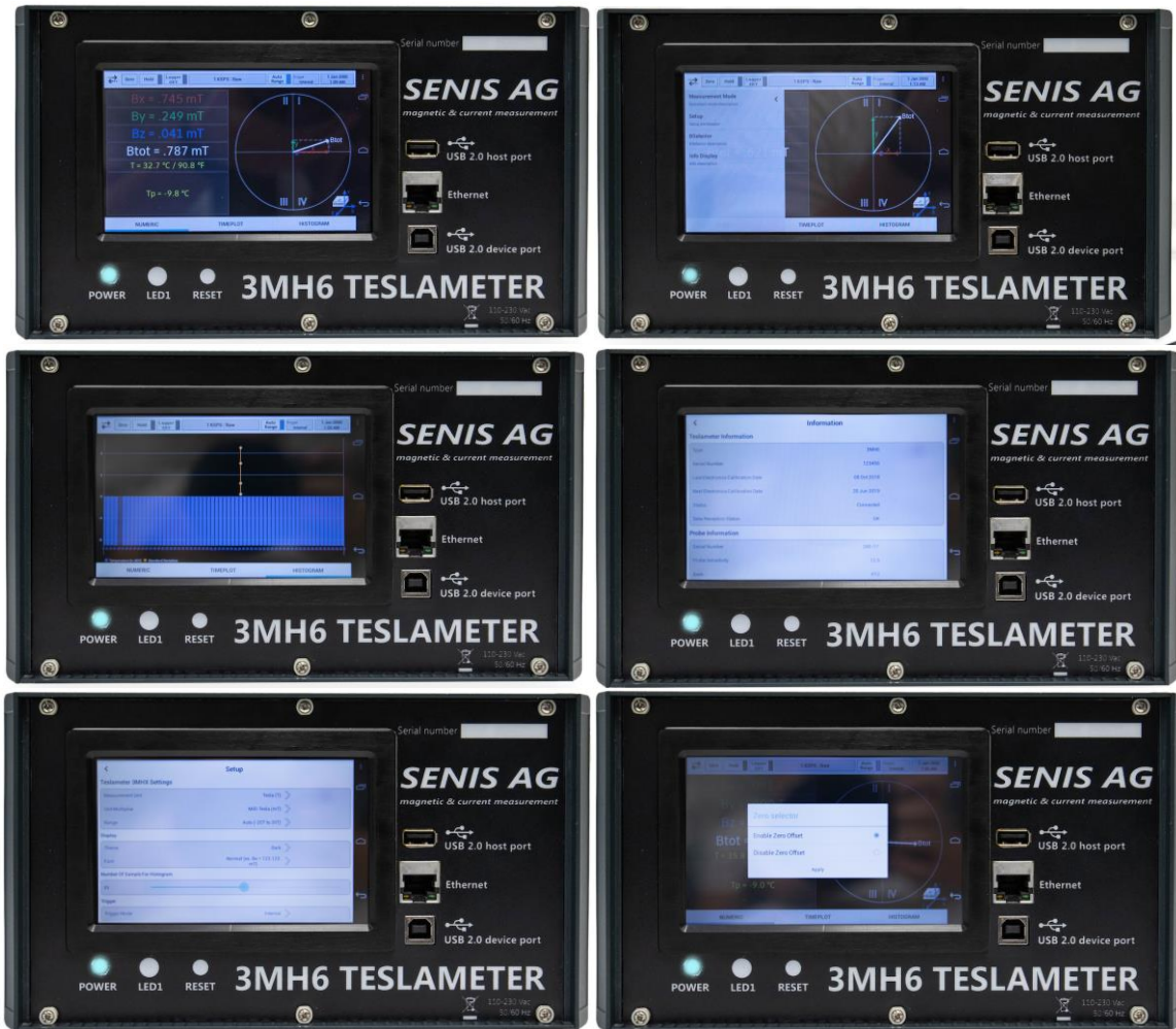
Figure 4: Visualization Modes (Numeric, Plot, Histogram) and Setting possibilities; External/Internal Triggers; Data Recording; Auto range; Zeroing; Min/Max; Hold reading;