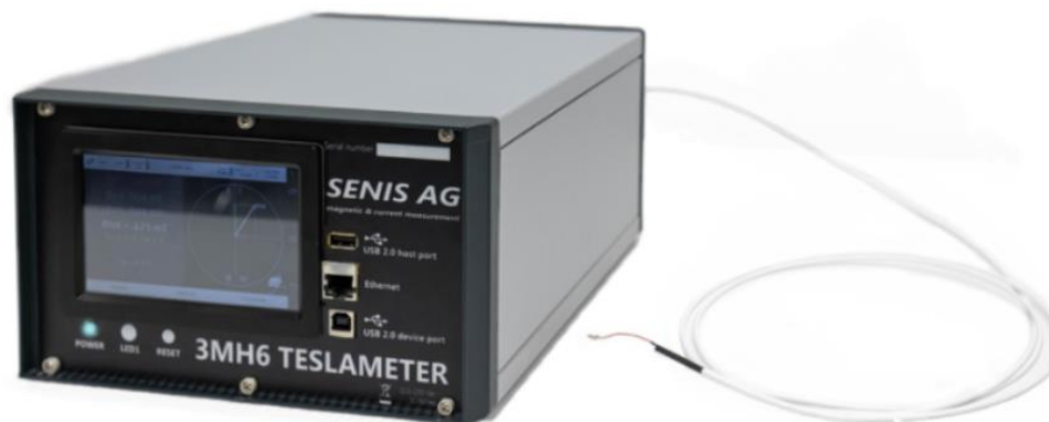
Figure 1: 3MH6 Teslameter